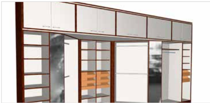
Furniture planning with defined material