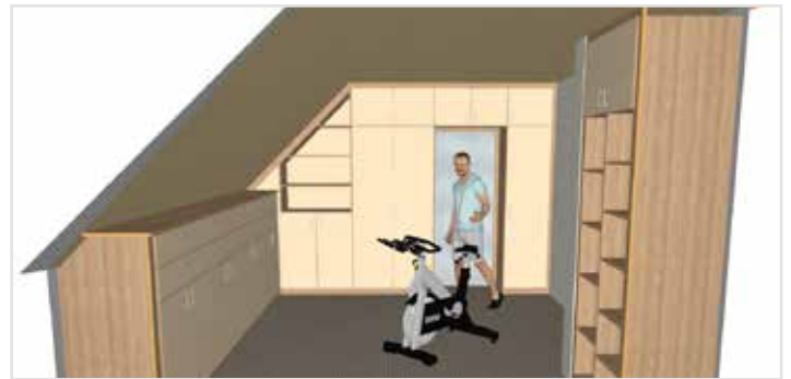
SmartWOP makes it easy to design all the furnishings for your spaces