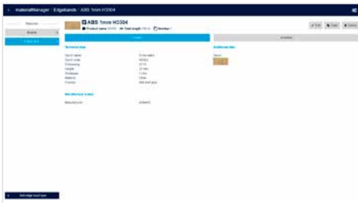
In the detailed view you can see all information at a glance.