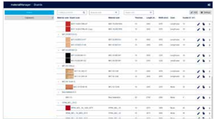
...and panel materials.