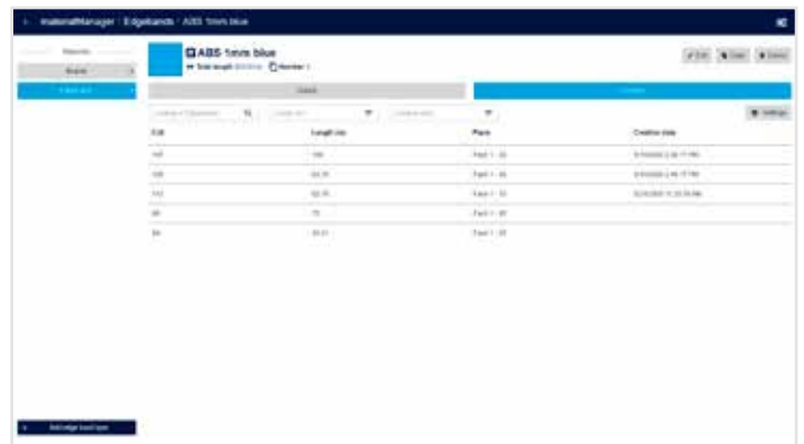
Overview of rest length and storage space of each edgeband.